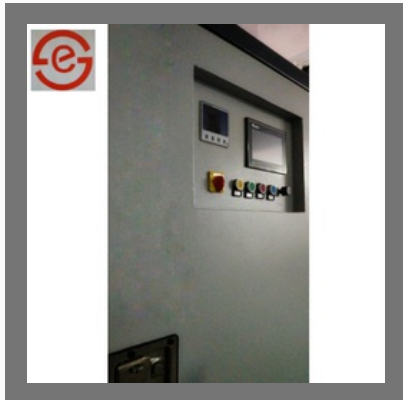
Induction Melting Furnace