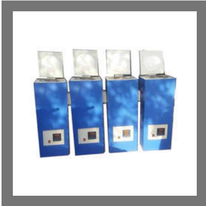
Aluminum & Zinc Melting Furnace