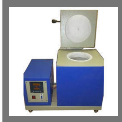
Aluminum & lead Melting Machine