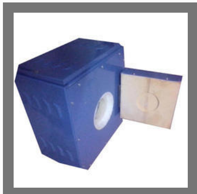
Gold Silver Melting Machine