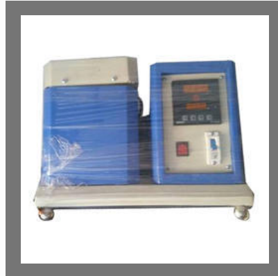
Silver Melting Machine