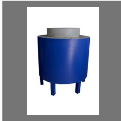
Aluminum Melting Furnace