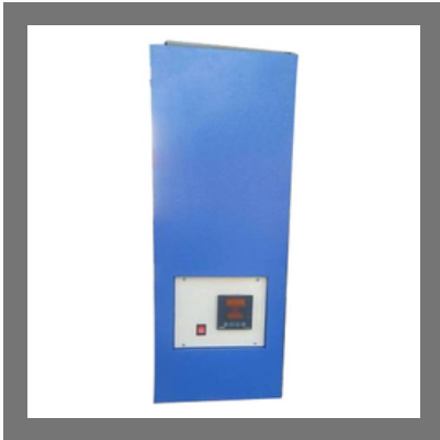
Aluminium & Zinc Melting Machine