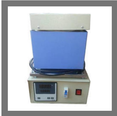
Gold Melting Furnace