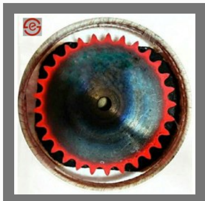
High Frequency Induction Hardening Machine