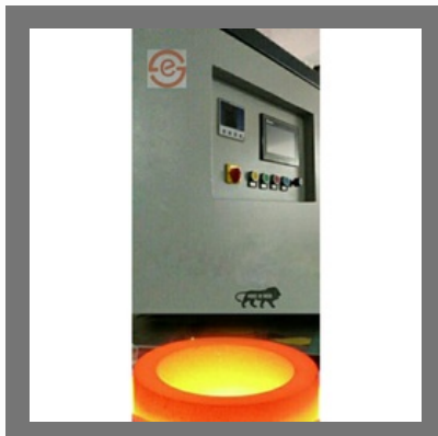
Brass Induction Melting Furnace