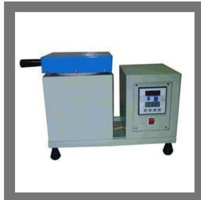
Efficient Gold Melting Machine