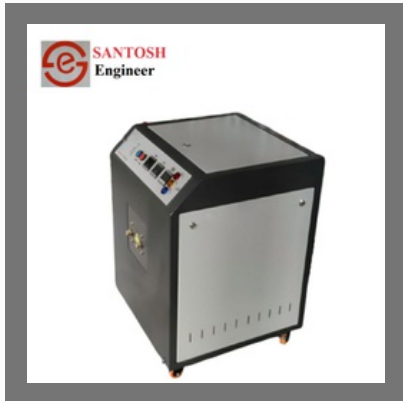
Induction Heating Furnace