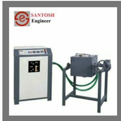
Induction Iron Melting Furnace