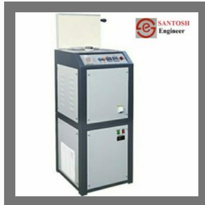
Induction Melting Furnace For Gold (1 KG)